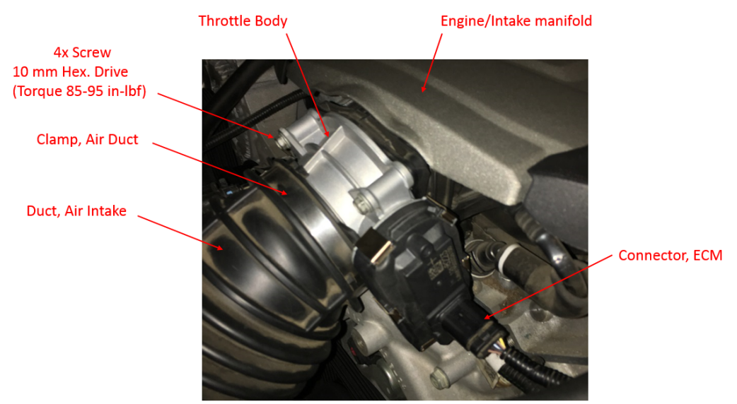
Figure 1. Throttle Body and mating components viewed from left (driver) side.

1- Refer to figure 1. Turn engine off and let it cool to ambient temperature, open the hood and locate the throttle body near the center of engine bay and in front of the engine.